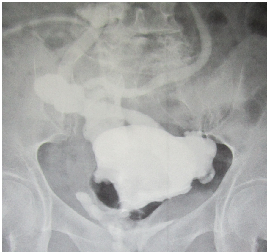
Figure 2: Pouchogram performed three weeks following surgery.

The silicon catheter was then reinserted and kept in place further for one week, allowing the patient to be dry. The last follow-up of the patient is 3 months following surgery, showing adequate healing and easily catheterizable umbilical stoma, with no urine leak. Close follow-up will be going on for the possibility of recurrence.