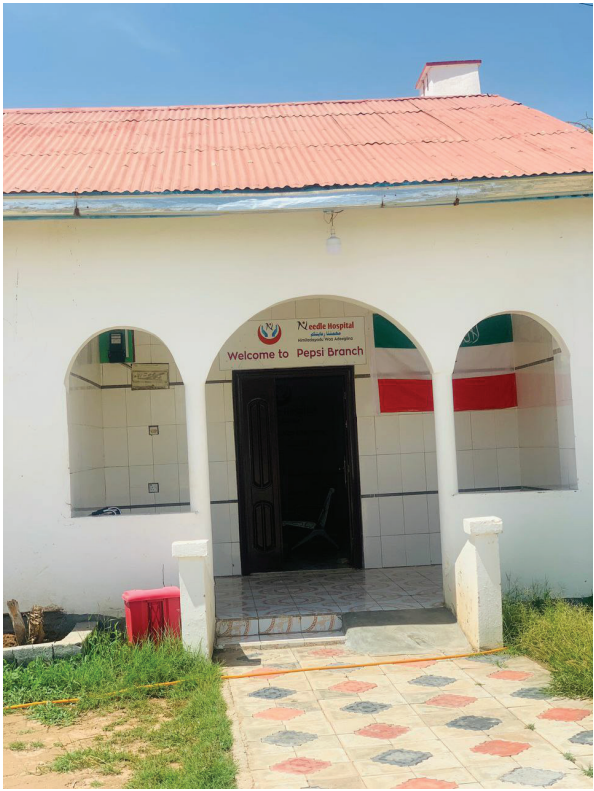
Figure 2. Needle Hospital, Hargeisa, Somaliland (Pepsi Branch).