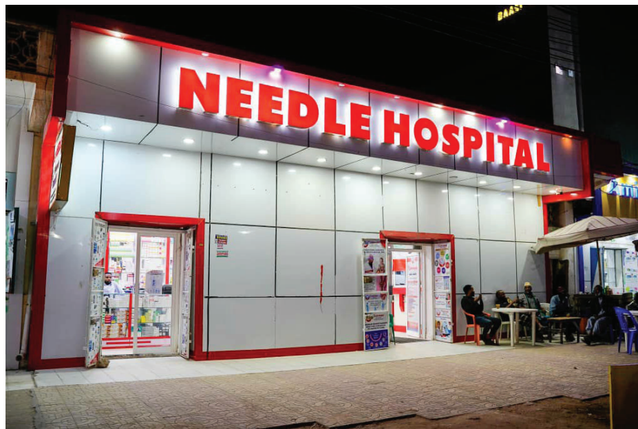
Figure 1. Needle Hospital Hargeisa, Somaliland (Main Branch).

The clinic provides services for patients from Somaliland and neighbouring countries including Djibouti, Somalia and Ethiopia. The pharmacy has a supply of most chemotherapy agents used for the treatment of solid tumours, hormonal therapy for breast, prostate and thyroid cancers, and some targeted therapies. Immunotherapy is not yet available. To date, more than 230 patients of many cancer types have been evaluated and treated in the cancer clinic. The most common types of solid cancers seen in the clinic are breast, oesophageal and prostate cancers, accounting for 17.0%, 8.3% and 7.4%, respectively (Figure 3).