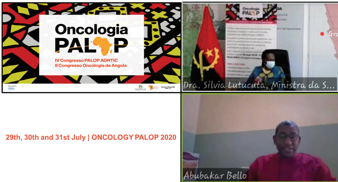
Figure 2. Open session. Silvia Lutucuta, Minister of Health of Angola and Abubakar Bello, President of AORTIC. (Photographed participants authorised their publication.)

ROCHE® sponsored the cost of the conference in accordance with their African Project to strengthen healthcare systems and cancer care. Each session had two interpreters to translate, simultaneously, from Portuguese to English or from English to Portuguese depending on the language used by the speaker during their presentation. The opening address of the conference was given by the President of AORTIC Prof. Abubakar Bello and the Minister of Health of Angola Dr Silvia Lutucuta (Figure 2). The Conference closure was carried out by the PALOP representative on the AORTIC Council Prof. Cesaltina Lorenzoni and the National Director of Public Health of Angola, Dr Helga Freitas.