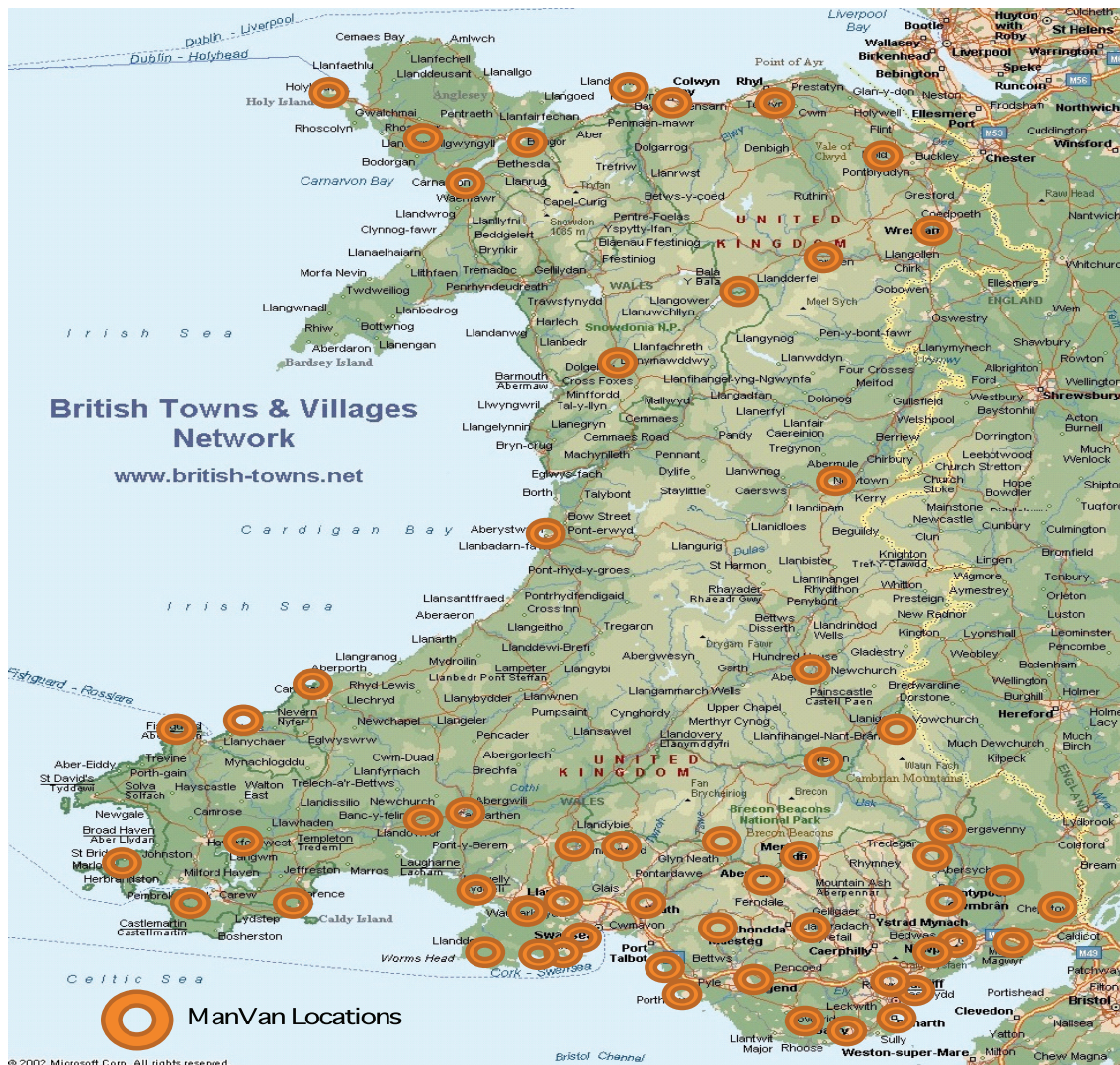
Figure 1. Map of Wales with locations visited.